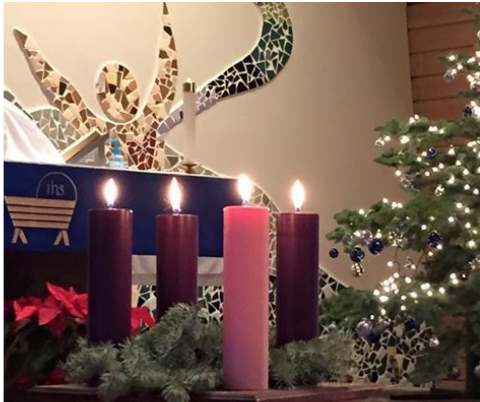
Our beautiful sanctuary