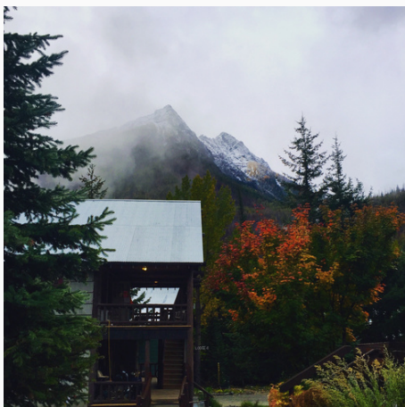
Photo of Buckskin Mountain at Holden Village, Fall 2016

In this Season of Creation, may we all take time to reflect on what new season God may be calling us toward, and how we are called to support one another in their changing seasons as well.